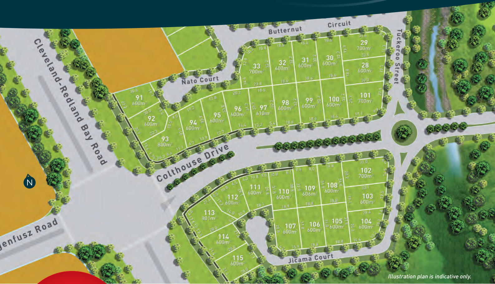
Illustration plan is indicative only.